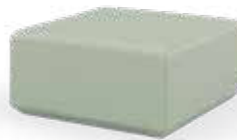
Square 1RYM-700 436H | 870W | 870D (mm) Product weight: 20kg Weighted option: 64kg