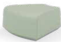
Wedge 1RYM-800 420H | 885W | 975D (mm) Product weight: 15kg Weighted option: 59kg