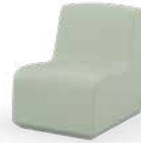
Chair 1RYM-300 835H | 650W | 870D (mm) Seat height: 435mm Product weight: 20kg Weighted option: 64kg