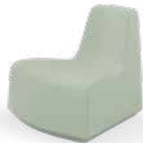
Curved chair (wide front) 1RYM-500 830H | 885W | 975D (mm) Seat height: 435mm Product weight: 18kg Weighted option: 62kg