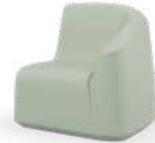
Armchair (left arm) 1RYM-100 835H | 850W | 870D (mm) Seat height: 435mm Product weight: 25kg Weighted option: 69kg