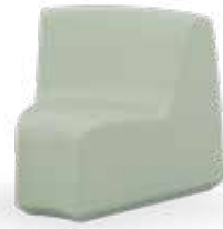
Curved chair (narrow front) 1RYM-600 830H | 885W | 975D (mm) Seat height: 435mm Product weight: 18kg Weighted option: 62kg