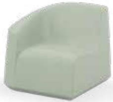
Armchair (right arm) 1RYM-200 835H | 850W | 870D (mm) Seat height: 435mm Product weight: 25kg Weighted option: 69kg