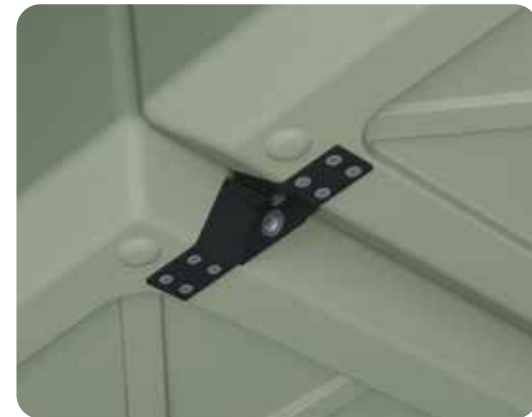
Optional linking bracket