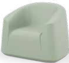
Armchair 1RYM-400 835H | 1052W | 870D (mm) Seat height: 435mm Product weight: 27kg Weighted option: 71kg